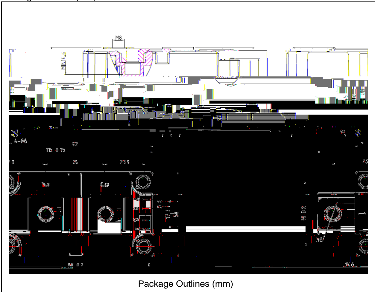
Package Outlines (mm)