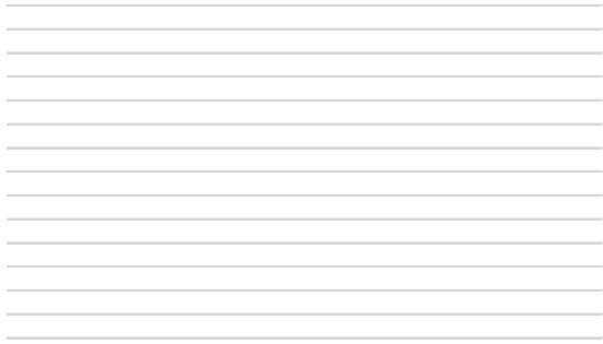
FIG.1: Maximum power dissipation versus RMS on-state current