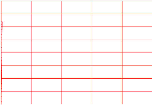
FIG.1: Maximum power dissipation versus RMS on-state current