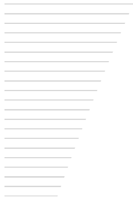
FIG.5: On-state characteris