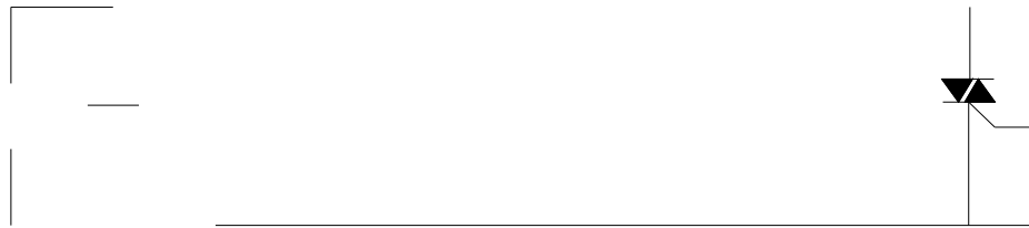
FIG.7 ÖTest circuit for inductive and resistive loads to IEC-61000-4-5 standards